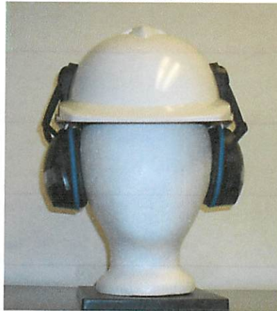
Test Item: Q3183A

These data were obtained through measurements made at the laboratories of Michael & Associates, Inc., State College, PA, USA. Michael & Associates, Inc., is accredited to test to ANSI S3.19-1974, ANSI S12.6-2008, ANSI S12.42-2010, EN352 parts 1-8 and AS/NZ S1270:2002 by the National Institute of Standards and Technology (NIST) National Voluntary Laboratory Accreditation Program (NVLAP).